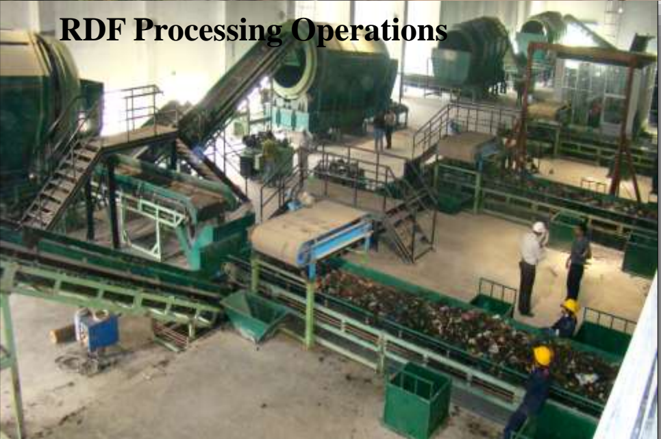
RDF Processing Operations