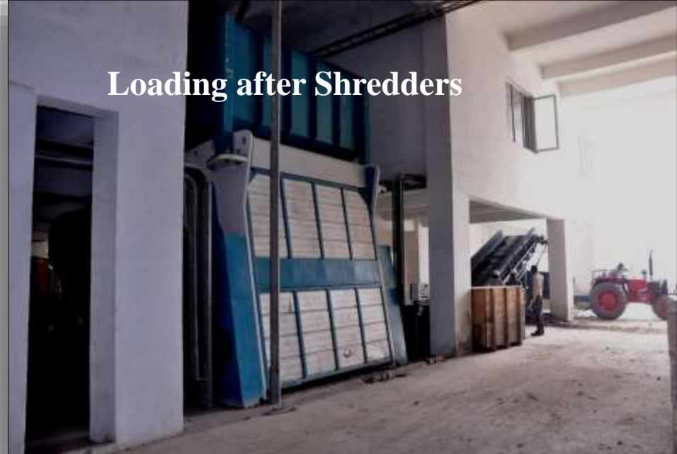
Loading after Shredders